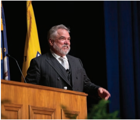
Pictured: Murray State alumnus and actor W. Earl Brown